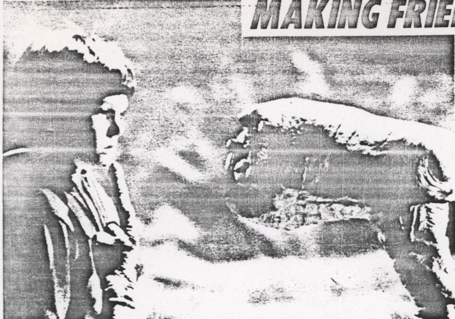
Love bridges the galaxy gap between Elliott (Henry Thomas) and E.T. But even though this friendship is loved by moviegoers, it could have put the boy behind bars in real life.

BELIEVE it or not, if you touch a being from outer space like E.T., as Elliott, the boy-hero of the hit movie did, you'll be in for BIG trouble.